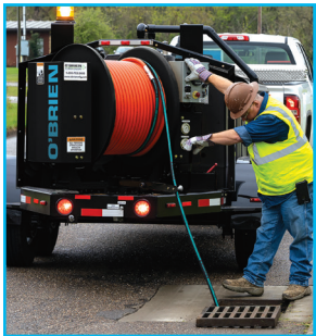
190° Rotating Hose Reel