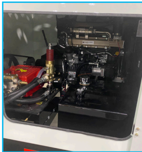
PTO-Driven Water Pump