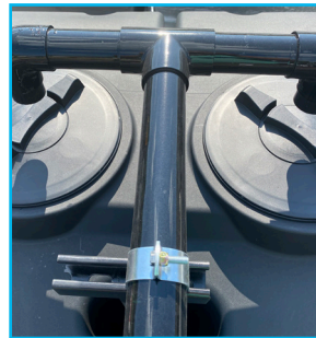
700-Gallon Onboard Water Capacity